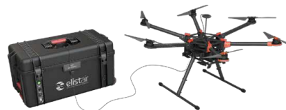
Tethered drone with the Elistair Safe-T station

Elistair provides tethered drone solutions offering continuous and real-time aerial video fully adapted for road traffic monitoring. As Lyon's suburb concentrates much of the road traffic, Elistair conducted during rush-hour time road traffic measurement sessions located at a busy roundabout employing a civilian drone attached to the Safe-T tethered station.